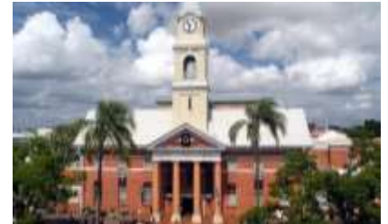
Maryborough Town Hall

Some 2 years ago, MTOQ formed a National committee to prepare for our hosting of the 2019 National T Tour. Our first job was to select the perfect place to base the event. From a list of options put forward by club members, 3 were shortlisted, and we went about the task of selecting from these. I could go on about our process, but suffice it to say that each town offered great amenities, very helpful and welcoming communities and local councils, and daily driving routes each with their own special flavor. In the end Maryborough won out. Being not too far north for interstate entrants to get to, it offers a unique mix of country and farmland to tour through, is a beautiful heritage town and it stands at the gateway to the jewel of the Fraser Coast, Hervey Bay.