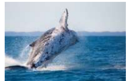
Whales of Fraser

Maryborough was home to P.L. Travers, author of 'Mary Poppins' and the town hosts an annual festival in her name. ...That's where the 'Pop in' part of our slogan comes from! For nature lovers, Maryborough is the gateway to the Fraser Coast and the world's largest sand island, Fraser Island. It's here each year, famous Migaloo and her companion Humpback Whales come to breed and give birth. So with Mary Poppins' ' Brolly ' and the ' Tail ' of our majestic whales as symbols, we knew we had found the perfect spot. Please join us here in 2019. Come for the Tour, then stay on to whale watch or venture to Fraser, or even further afield. Like us, you'll be surprised by what awaits you in Maryborough.