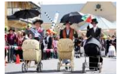
Mary Poppins Festival

Maryborough has always been a thriving mini city. Gold, the sugar industry, access to sea trade along the beautiful Mary River and a major centre for Queensland's rail and locomotive industry, have resulted in a prosperous town full of stunning heritage listed buildings. Grand old Queenslander homes still open their doors to public display regularly, and the local community is very proud of their hidden gem just a few short hours' drive north of the Qld/NSW border.