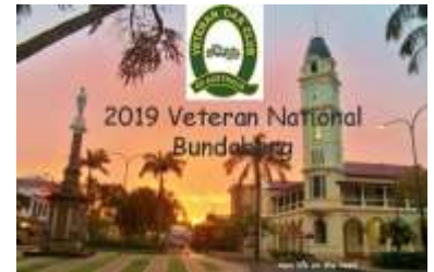
Veteran Club National