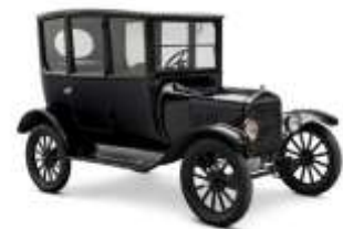
The 1919 T turns 100